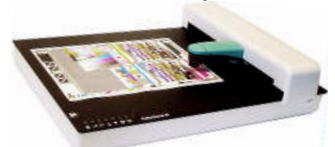
ColorScout A+ for micro tri gloss