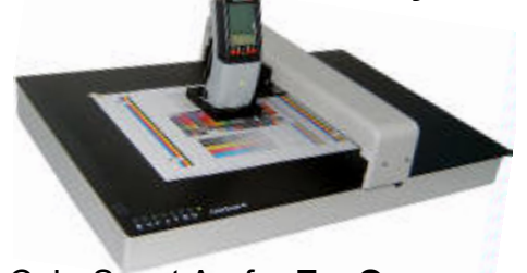
ColorScout A+ for EyeOne