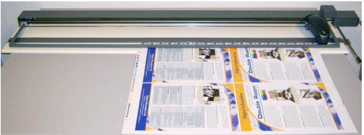
ColorScout X in 1105 mm format

The ColorScout X is a simple to use one dimensional moving system for automating a EyeOne or other scanning devices for print control. It is available in different lengths and with a feed through option.