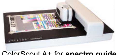
ColorScout A+ for spectro guide