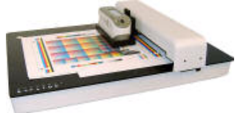
ColorScout A+ for SP64