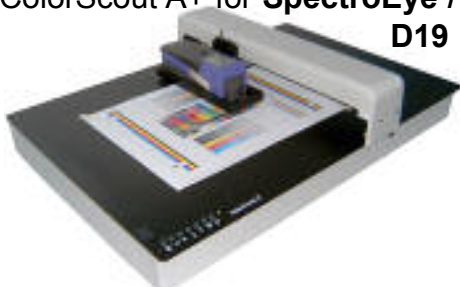
ColorScout A+ for SpectroEye / D19