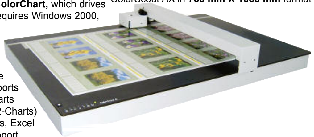
ColorScout AX in 750 mm X 1050 mm format