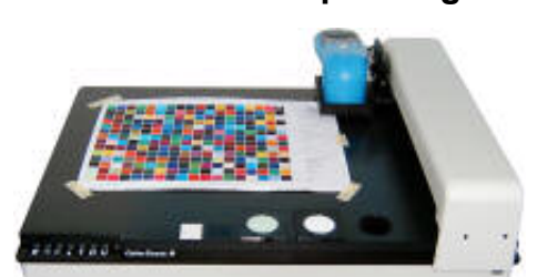
ColorScout A+ for spectro guide