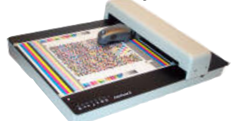
ColorScout A+ for CM-2600d