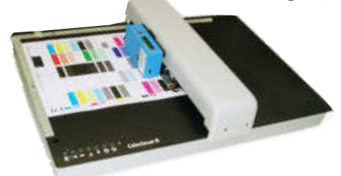
ColorScout A+ for Mercury